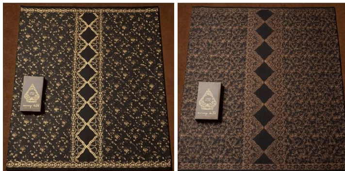
Figure 1. Sarung Motif

Sarung Batik ZR consistently innovates in its design to increase competitiveness, while prioritizing ethics by not plagiarizing others work, but rather through its own creation and modification. Creating batik motifs requires skill, technique, and inspiration from various sources, so they can be considered creative works. When discussing creative works, the copyright of the creator cannot be separated. Islam fundamentally regulates property rights and prohibits taking the property of others. Plagiarism of batik motifs violates the property rights of others, as plagiarism is a harmful act (Arifah & Fitria, 2025).